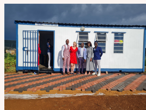
With the PYMA team in front of the classroom

The classroom ceremony was a tribute to the huge talent potential and energy of youth in South Africa. We heard from one of the first learners of the programme who shared with us how he started learning in a garage sitting on bricks, a parent of a child whose child has flourished through the programme, were spellbound by an incredible poem written by one of the past students and current tutors, connecting with individuals, these are but a few of the incredible moments which will hope to share with you over the course of next year through Social Media and on our Website.