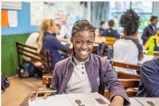
Bright Start Video

In one of the most unequal countries in the world, Bright Start Education Support Programme levels the playing field. With its truly holistic educational program, Bright Start ensures that children in Hout Bay, Cape Town have the opportunity to reach their best potential and to follow their dreams.